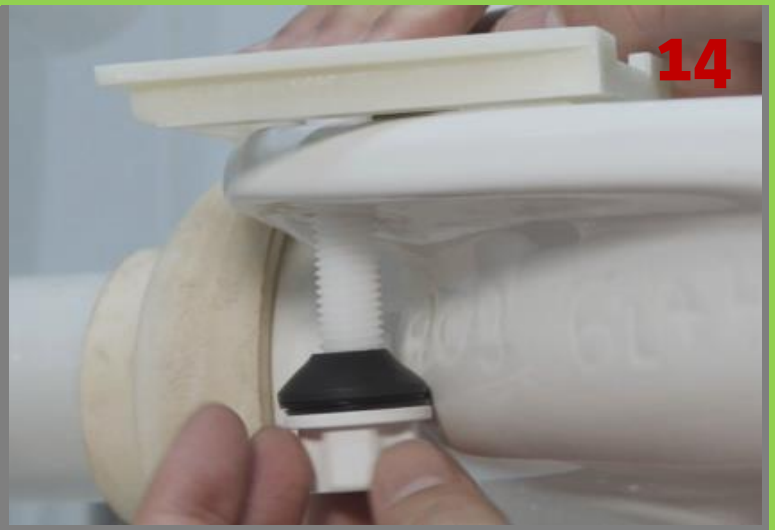
Secure the Seat Bolts