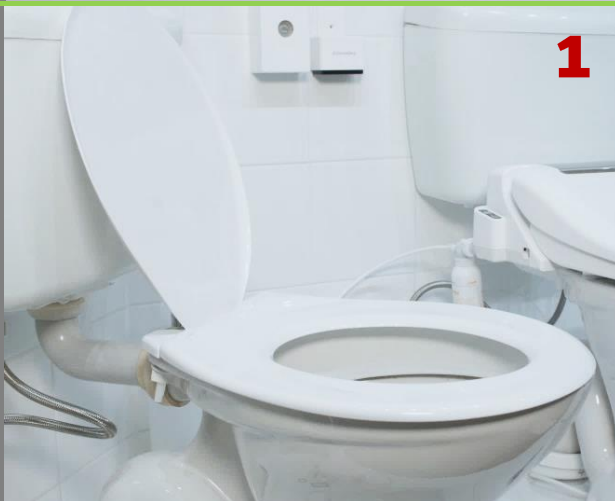
Remove Existing Toilet Seat and Lid