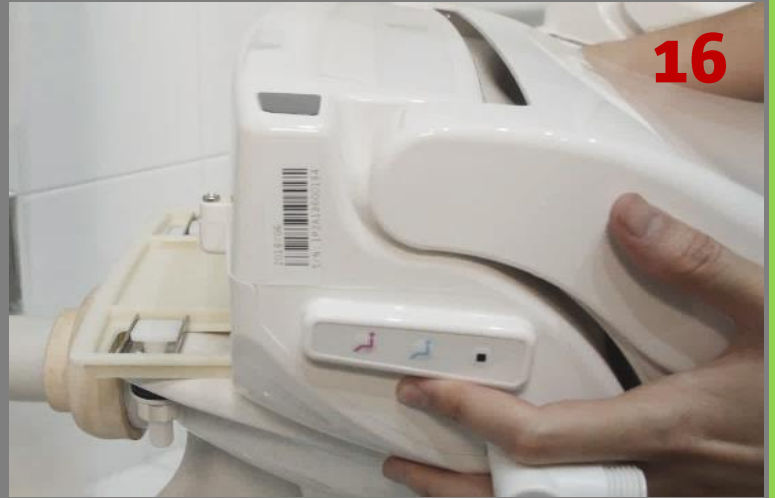
Slide the Bidet onto the Base Plate