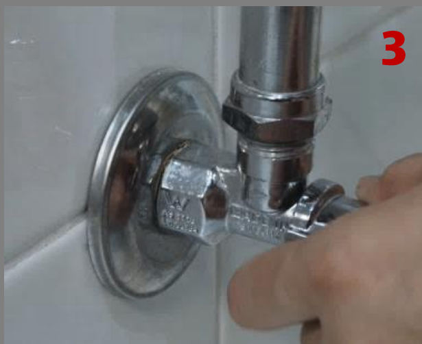
Turn Water Off