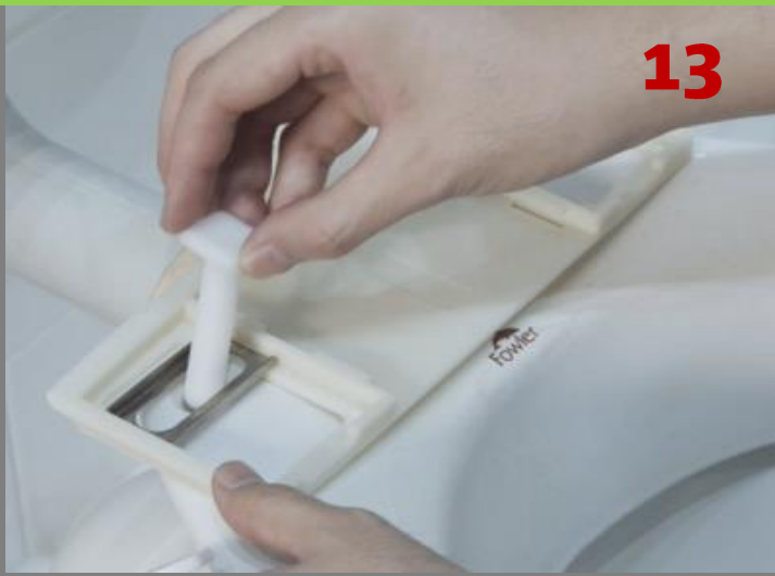
Insert Seat Bolts Through Sliders Into Bolt Holes