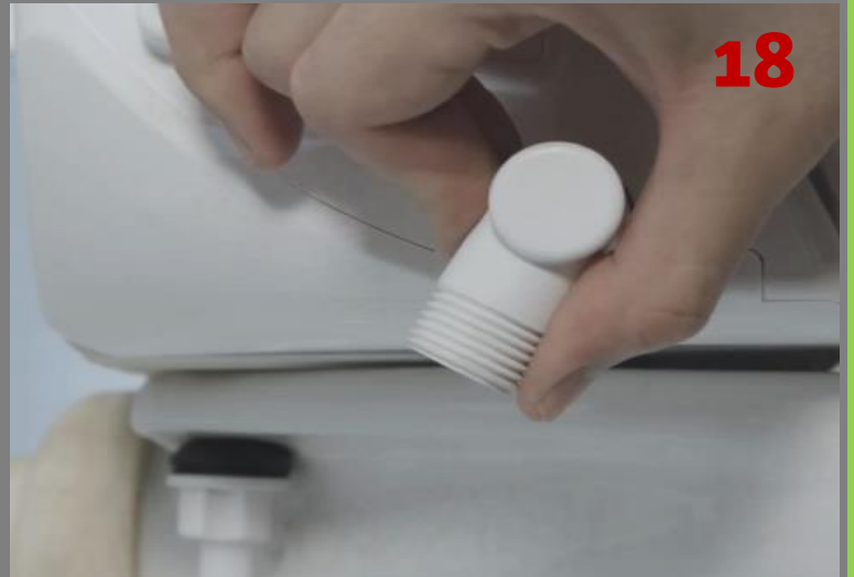
Connect Braided Hose to Bidet