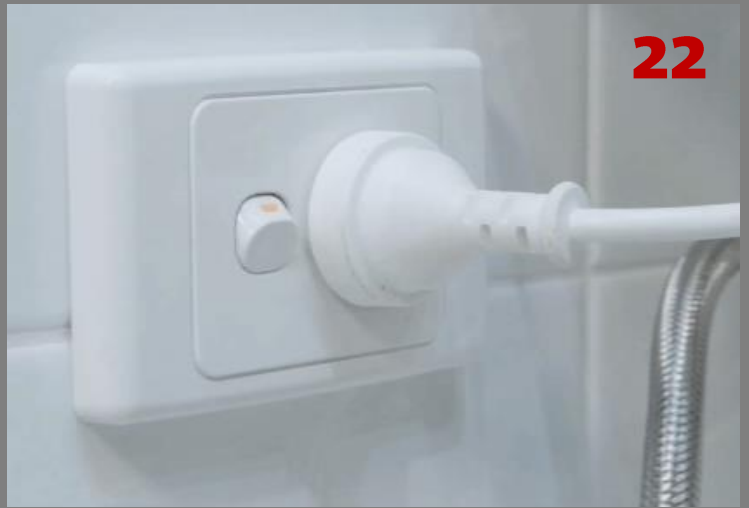
Turn Water On