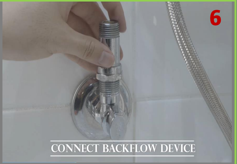
CONNECT BACKFLOW DEVICE