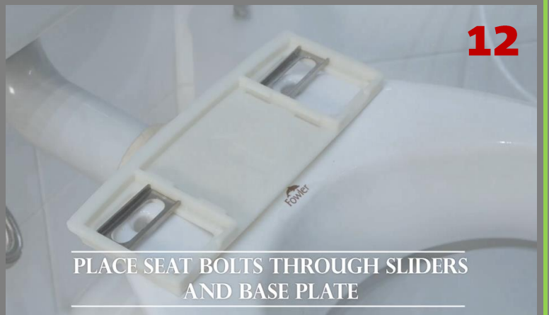
PLACE SEAT BOLTS THROUGH SLIDERS AND BASE PLATE