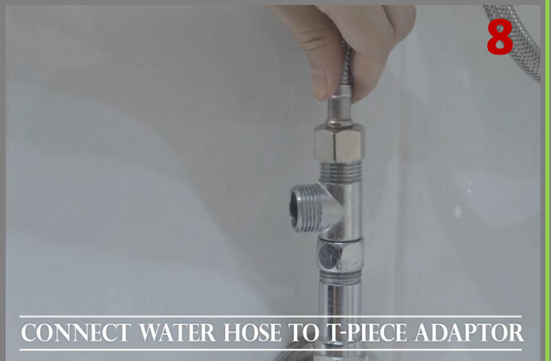
CONNECT WATER HOSE TO T-PIECE ADAPTOR