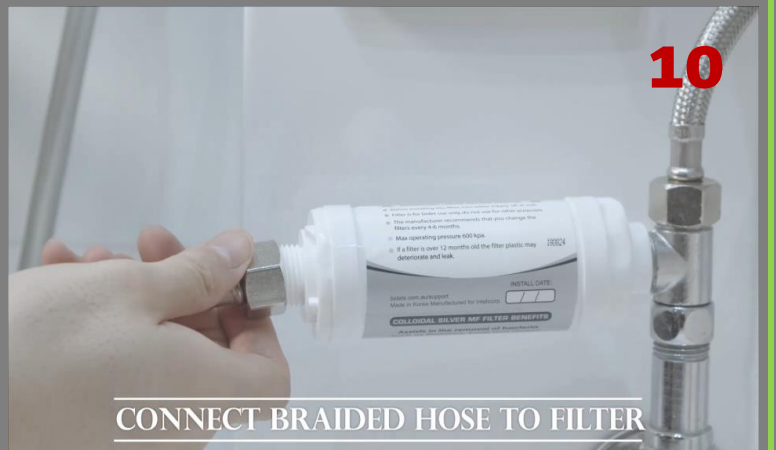
CONNECT BRAIDED HOSE TO FILTER