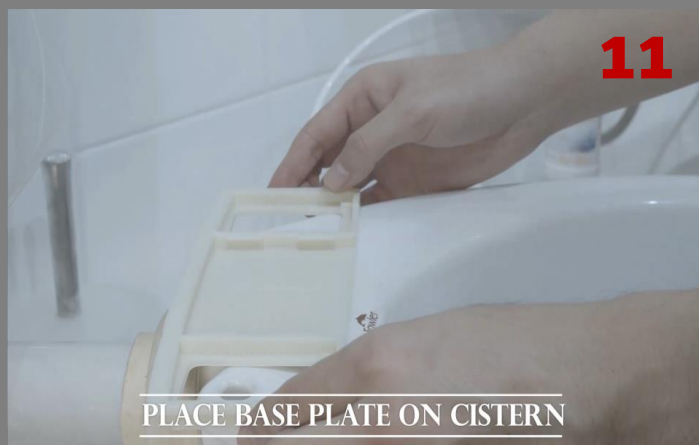
PLACE BASE PLATE ON CISTERN