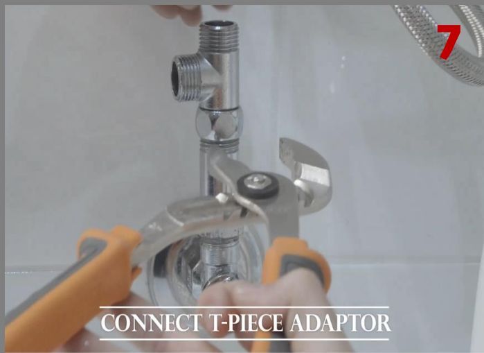
CONNECT T-PIECE ADAPTOR