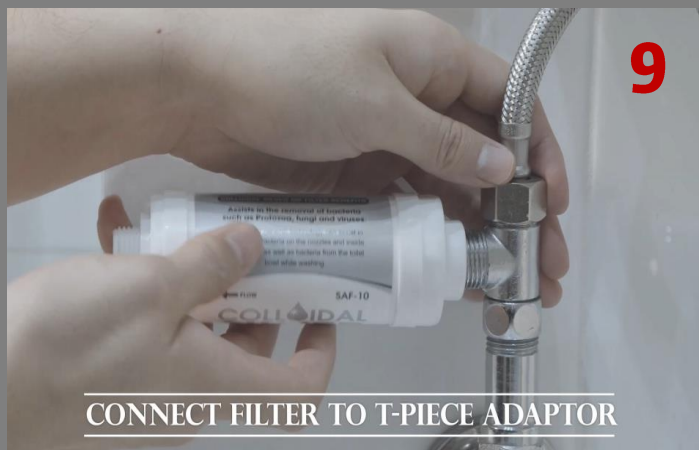
CONNECT FILTER TO T-PIECE ADAPTOR