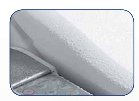
Engineered for your safety

After cleansing is complete, the warm air dryer leaves you feeling fresh and dry.