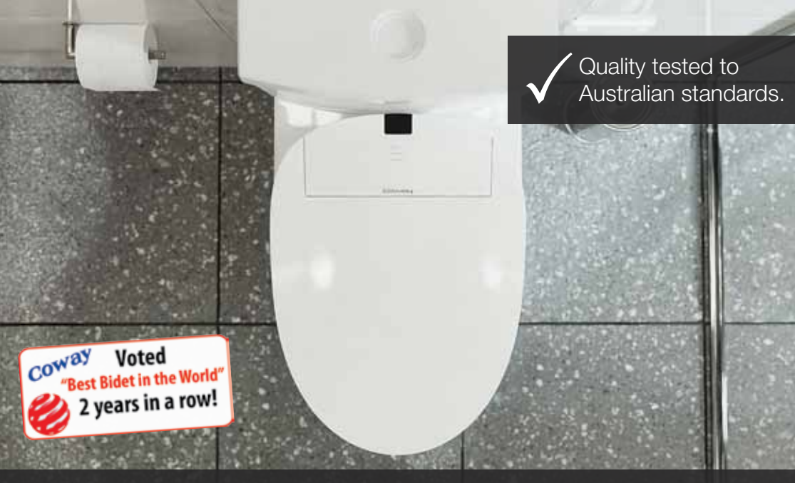
Coway has won many awards over the years and has won the best bidet in the world award.